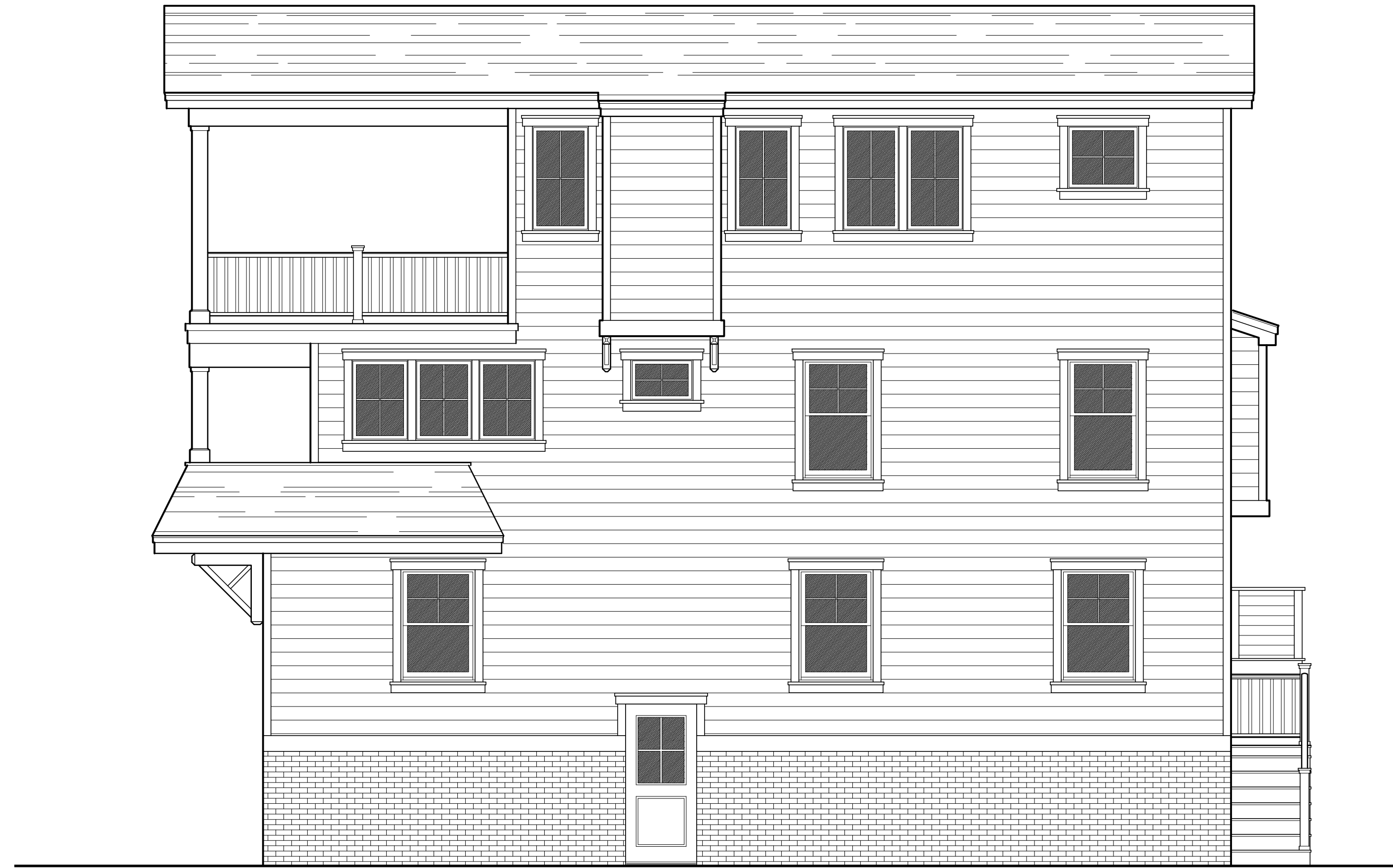
RIGHT ELEVATION SCALE: 1/4"=1'-0"