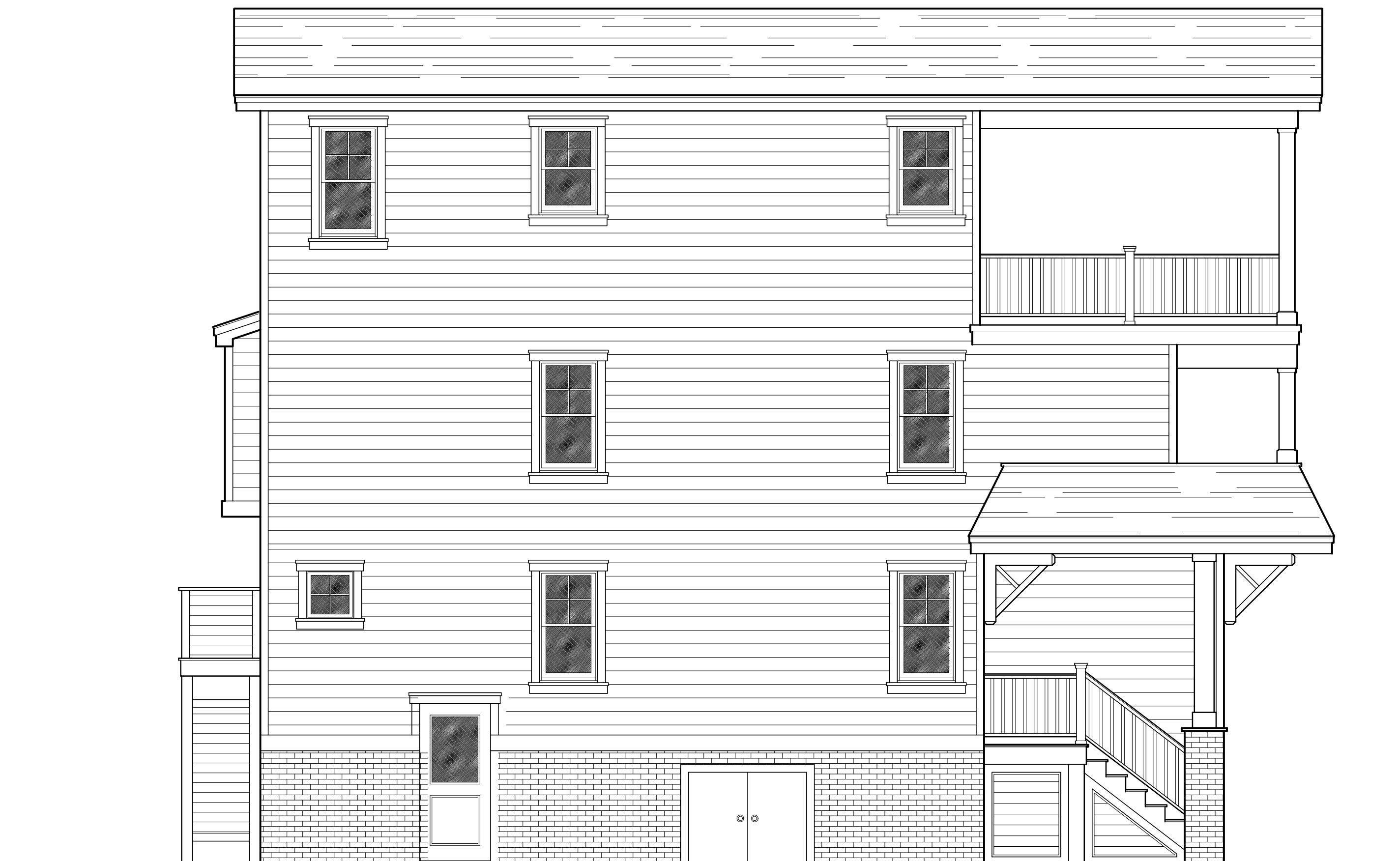
LEFT ELEVATION SCALE: 1/4"=1'-0"