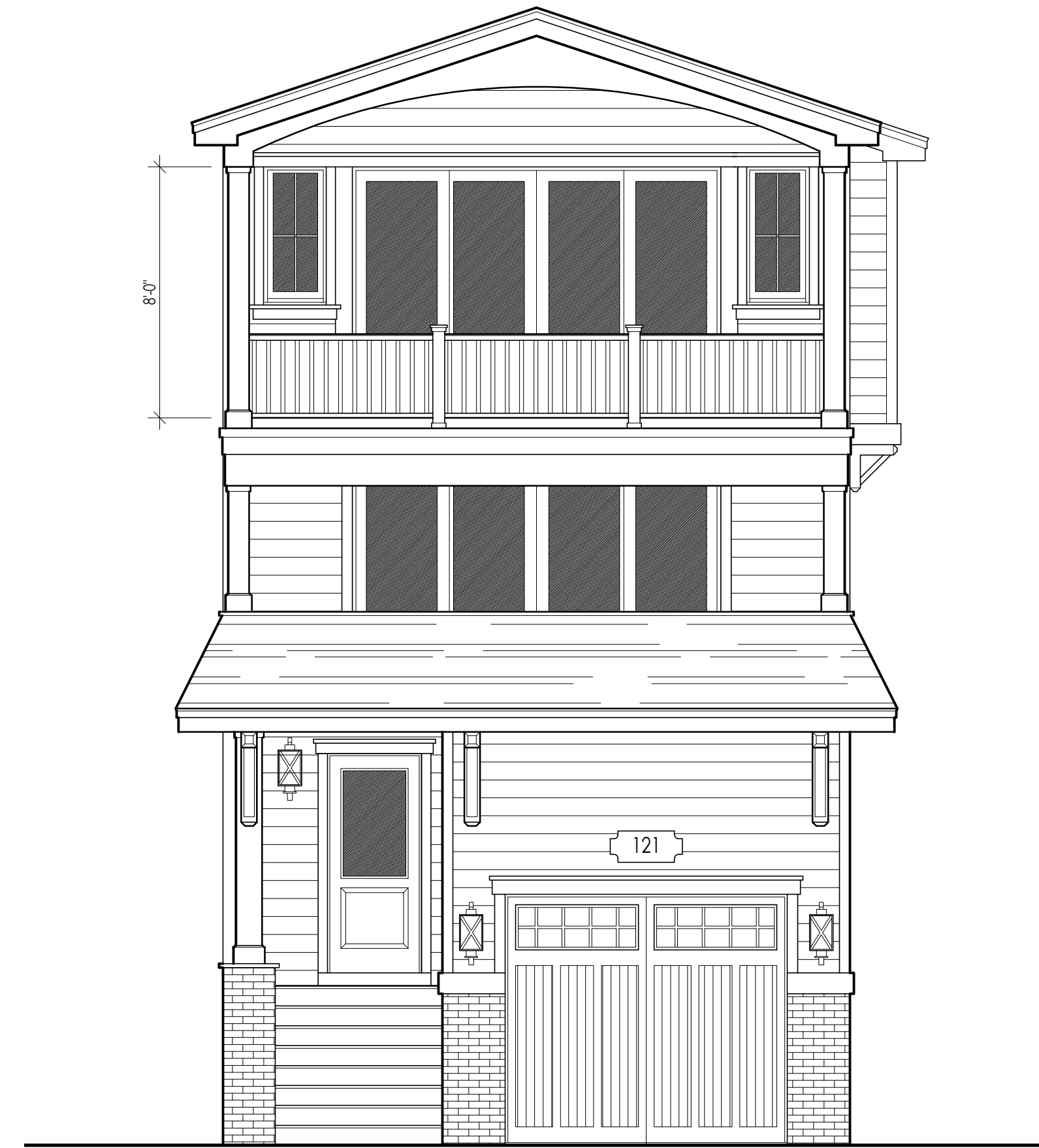
FRONT ELEVATION SCALE: 1/4"=1'-0"